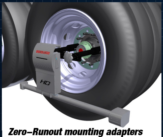
Zero-Runout mounting adapters

Available in 6 or 8 sensor configurations. (6 sensor shown here)