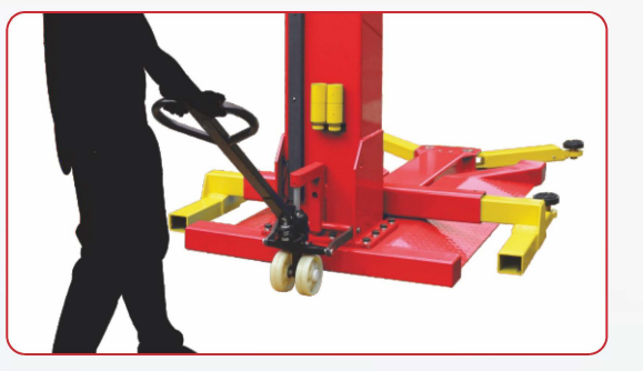
"Jack Pallet"style device allows the lift to be moved wherever you need it.